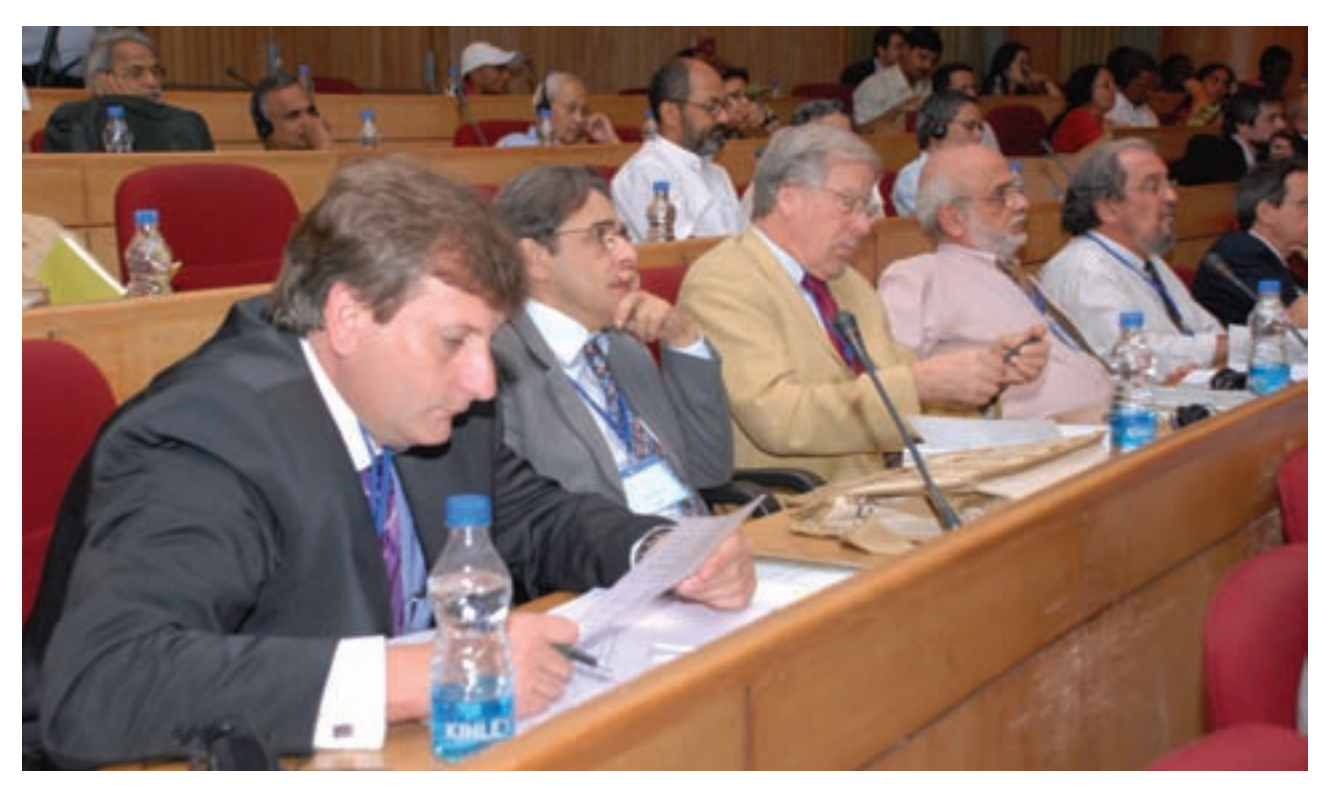
Members of the conference delegation from Brazil

and towards expenditures on public goods like agricultural research and rural roads (e.g. in India), supporting smallholders and family farms in less-favoured areas, policies to reduce rural–urban disparities (e.g. fiscal stimulus focusing on rural areas), and further reforms in land and land-use ownership (e.g. China).