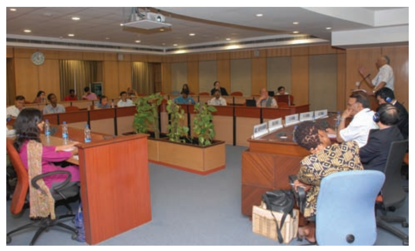
Parallel working group sessions enabled detailed sharing of innovations and practice

adaptation in the context of, for example, adaptation to climate change through the maintenance of biodiversity, needs to be recognized and understood.