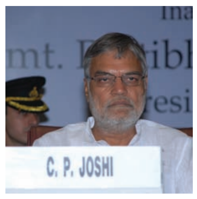
Minister C P Joshi, Minister for Rural Development and Panchayati Raj, Government of India

is considerable scope for strengthened understanding and learning, and to identify special initiatives for collaboration among emerging economies. These countries can and will contribute to a 'new economic order', given their trading position, and this will require change – noting that more is needed for faster change.