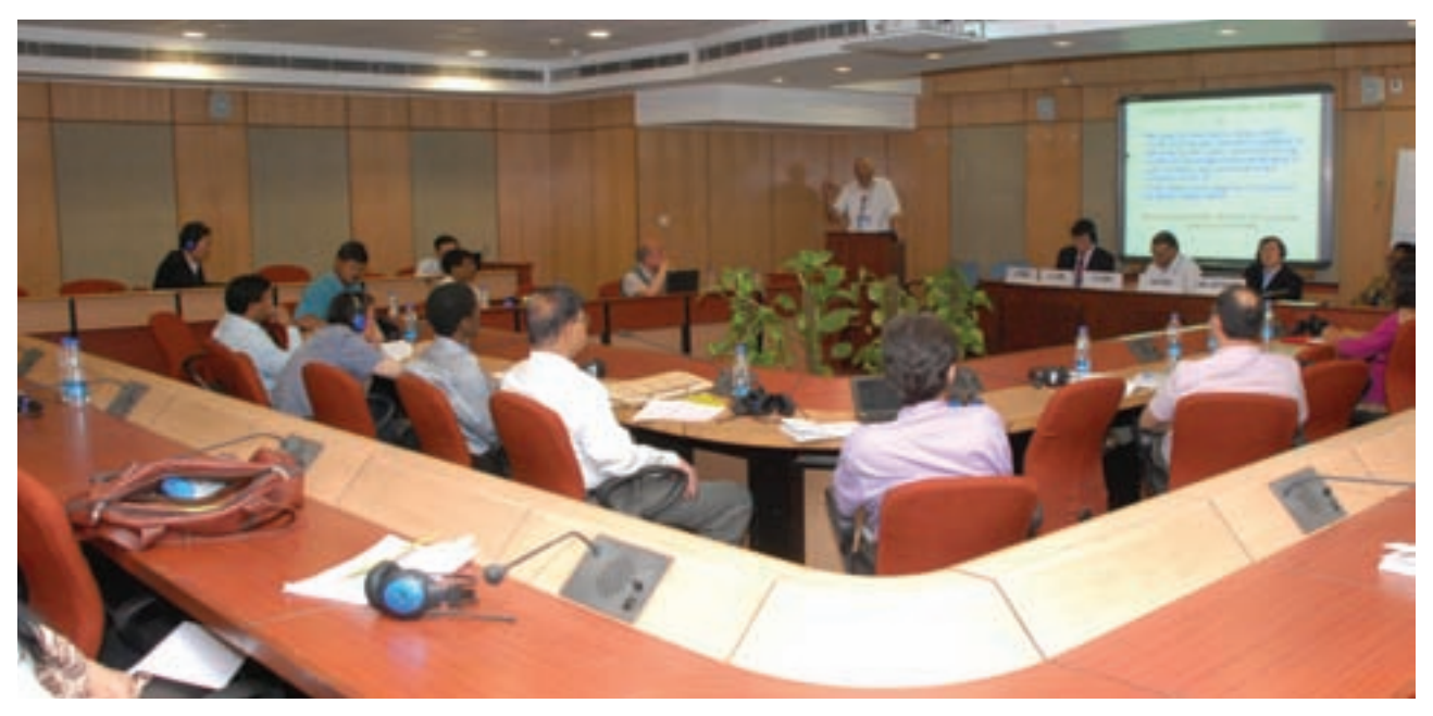
One of the parallel working group sessions

In the case of China, there was interest in how village councils come into existence. It was noted that these are largely a result of 'bottom-up democracy'. Village-level autonomy is ensured financially by making sure that each village council has adequate finances to support operational costs, including salaries.